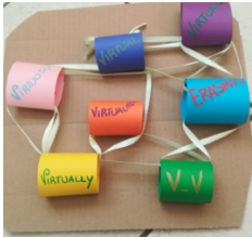
Tunnels and bridges

These are their final logos representing each group different ideas and strategies: