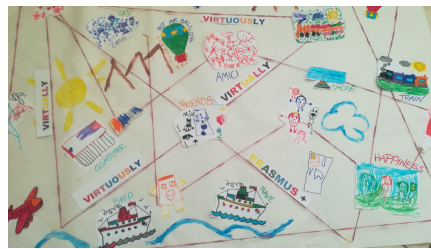
Means of transport and feelings