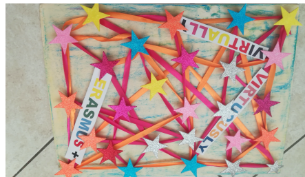
Different cultures shining in stars

Though we knew the pictures of these 3D logos would have been difficult to use as a final logo for the contest, we thought the experience of really touching the connections behind the concepts was the only way such intellectual concepts could be transformed into real images.